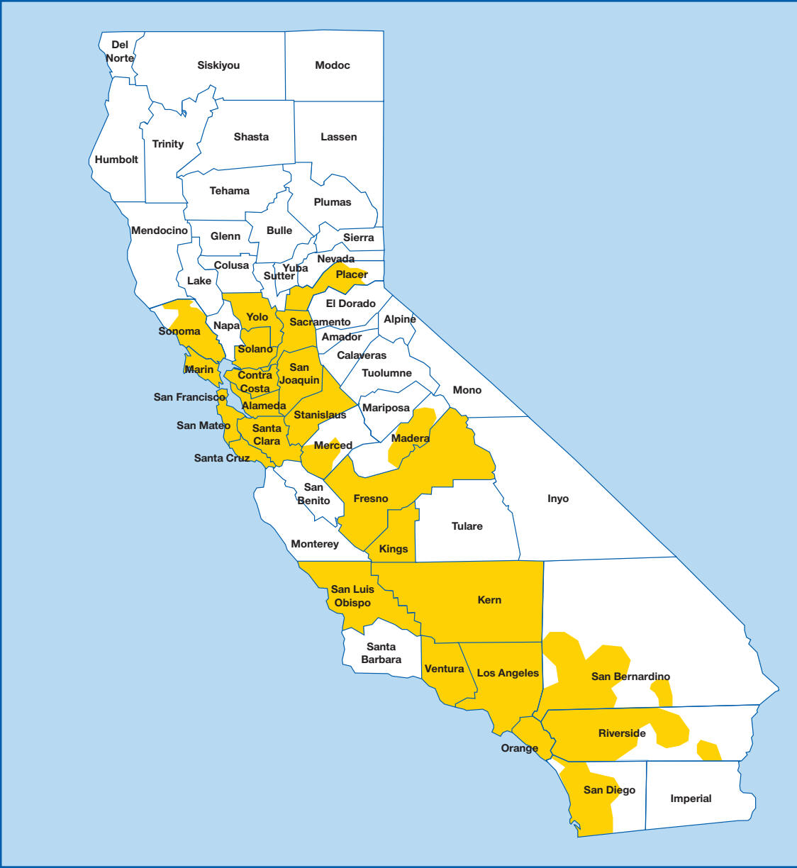
■ UnitedHealthcare Alliance Service Area 6